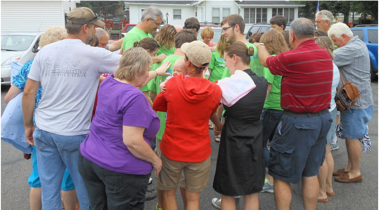
Praying over the work campers before they left on their trip.